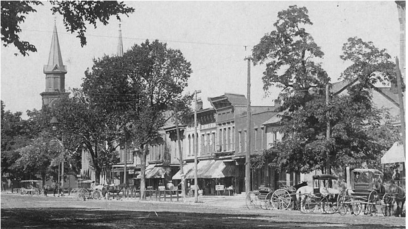
East Broadway downtown was lined with hitching posts during Augustus Rogers' tenure as mayor.

Notwithstanding this episode, the genial Rogers remained popular in the Granville community and was elected as the Justice of the Peace for Licking County in 1870. In 1872 he was elected mayor of Granville by a comfortable margin and took office in April of that year. 2