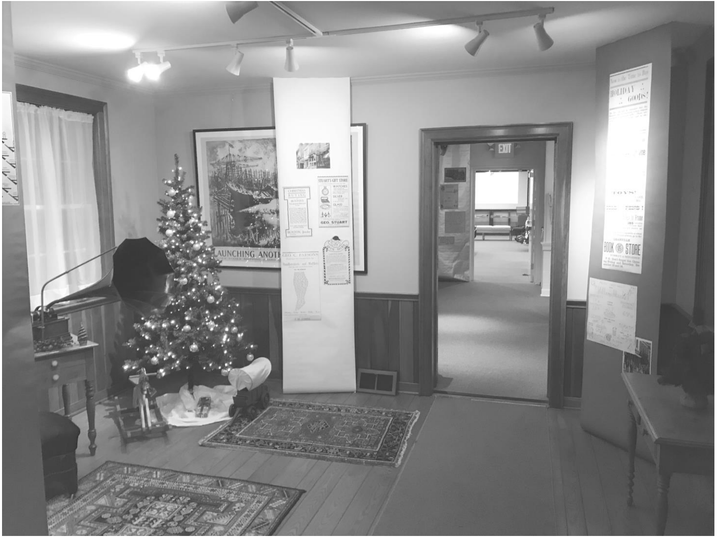
ABOVE: The Granville Historical Museum was decorated for the holiday season with displays featuring newspaper advertisements of yester-year by local retailers.