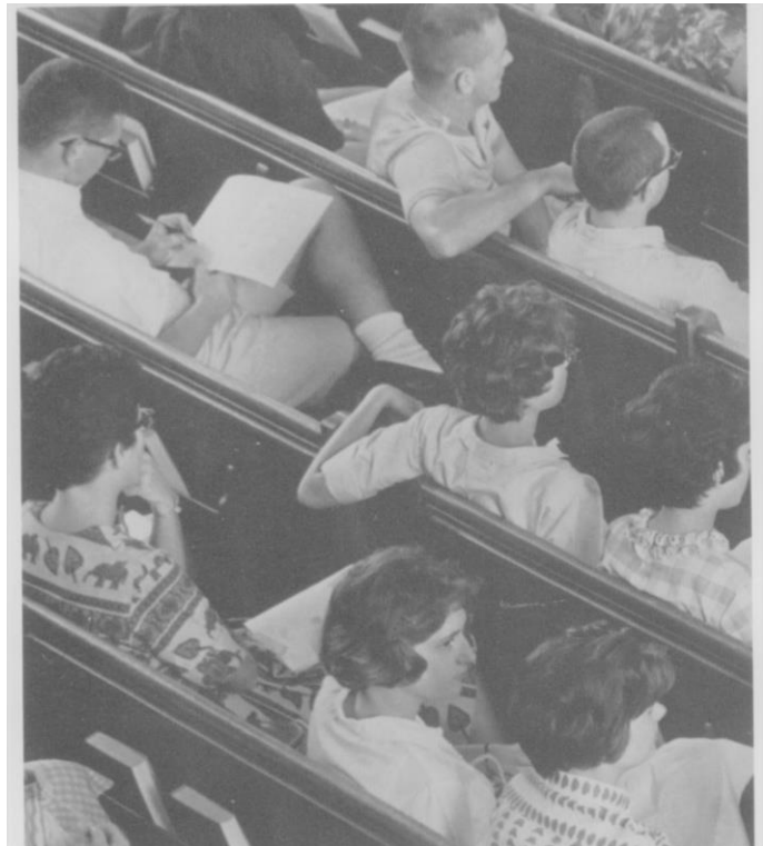
Rapt attention during Chapel – attendance for credit. Just off to the right is the knitting section.

Our innocence had taken a hit in November 1963, when something unimaginable happened. For white, middle and upper class Americans, especially Protestants, life had gotten better and better in the only major economy in the world that was strengthened rather than damaged or destroyed by World War II, and with the GI bill, big union contracts, virtually no inflation, the reality of owning a house and car, and decreasing material shortages raised the quality of life for many in the white