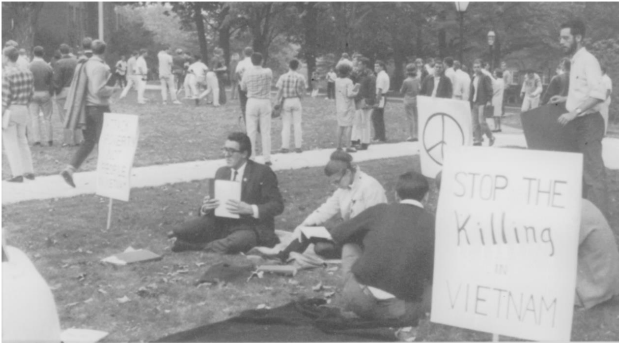
“Freedom of thought, freedom of expression” was the yearbook’s caption for a page of Vietnam era photos, which included this shot of an early protest on campus during the 1965-66 school year.