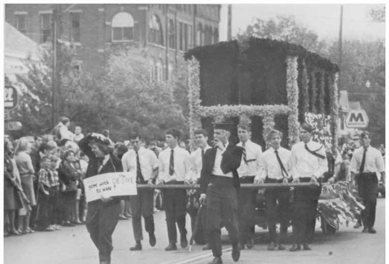
Floats were imaginative when there was still a Homecoming parade, in 1966, when pledges could still be compelled to build them. Note the old Gregory Hardware building still standing in the background at the corner of East Broadway and North Prospect Street.