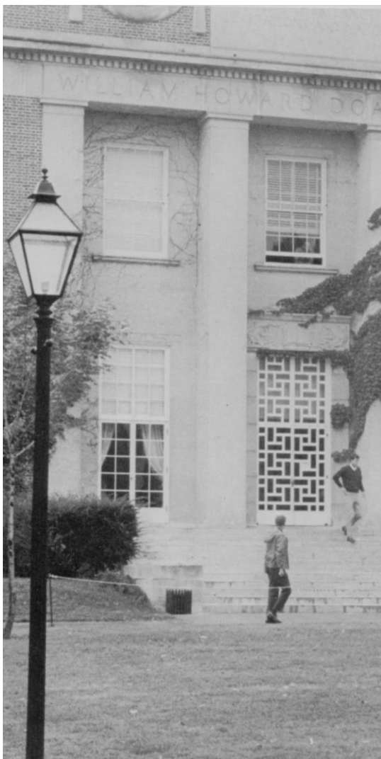
Doane Library still had its original front during the sixties. Later, specifications of the Seeley Mudd Foundation gift to expand the library included relocating the entrance.