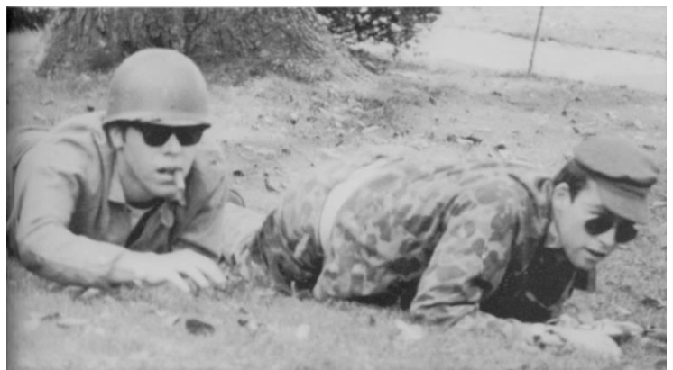
Farther down the quad, two would-be marines watched the protest.