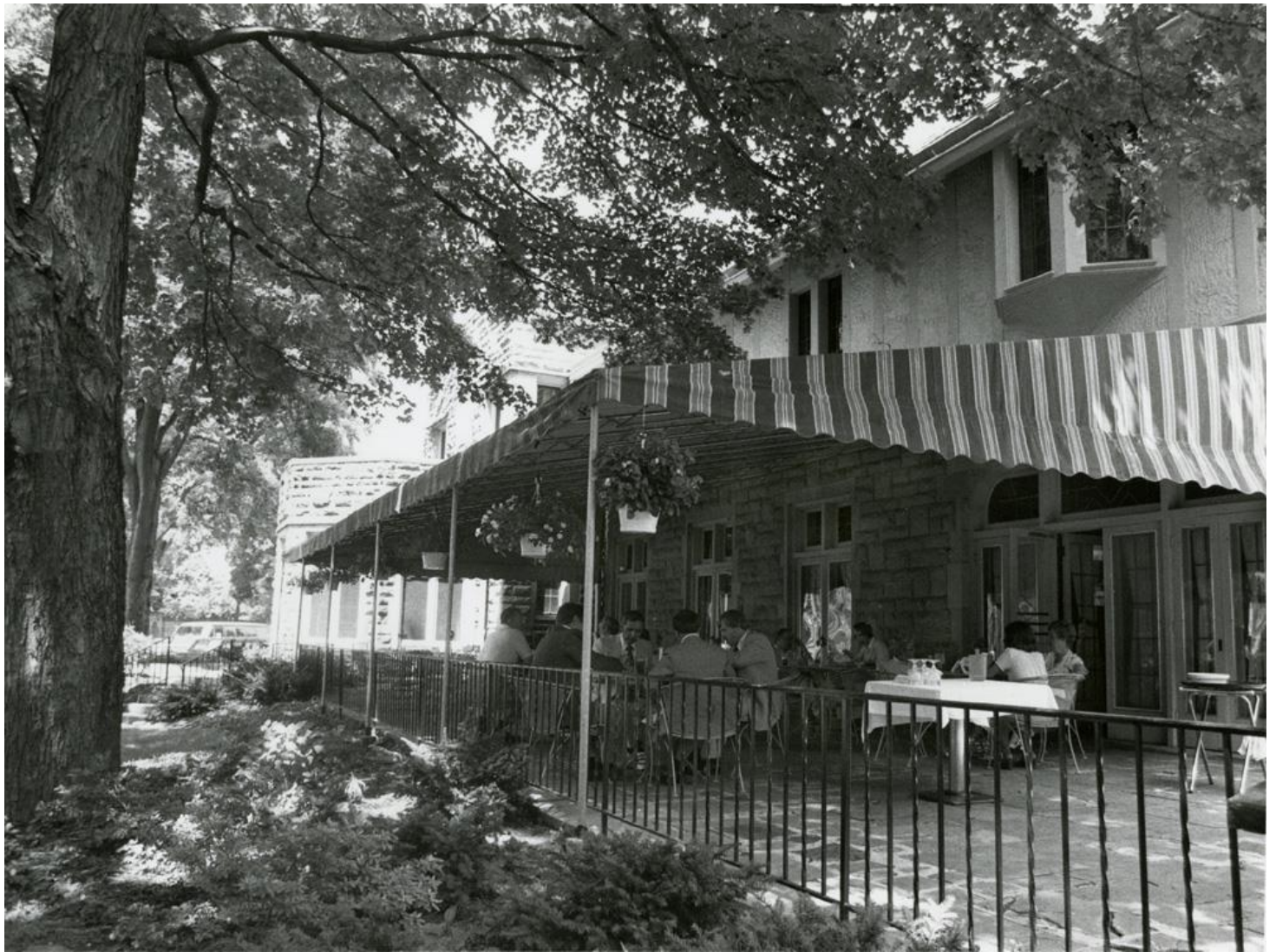
ABOVE: When a canopy was added, the front patio became a popular dining spot for the inn.