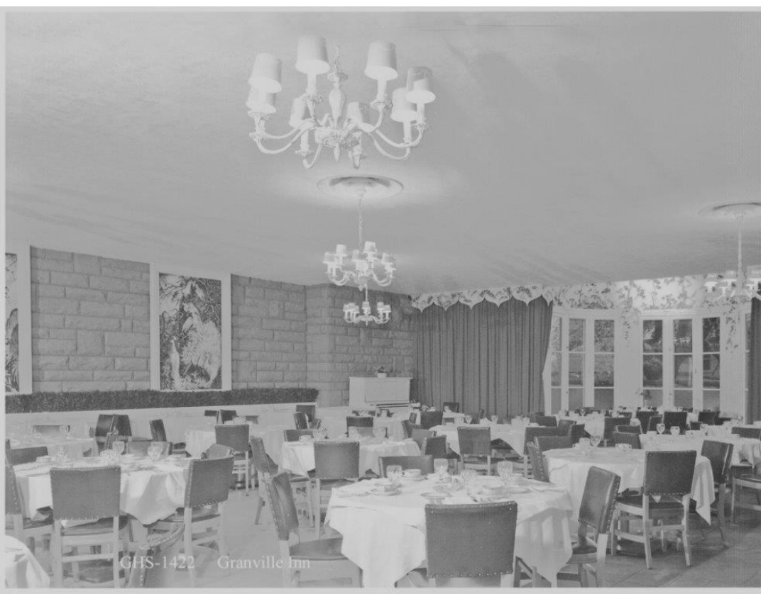
LEFT: Once known as the Peacock Room, the large dining area in the rear of the inn became the Great Hall, and is now the Denison Room.