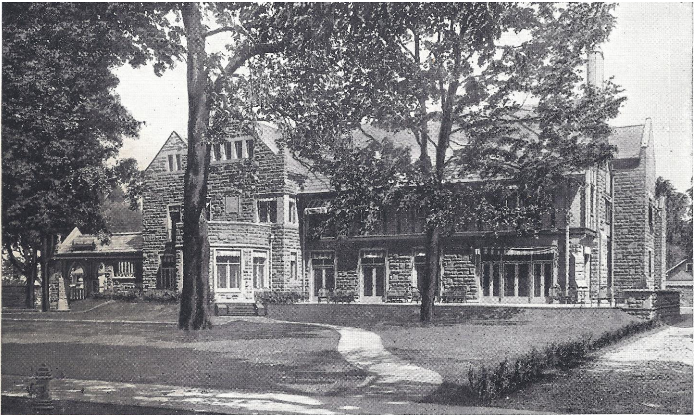
Granville Inn, Granville, Ohio