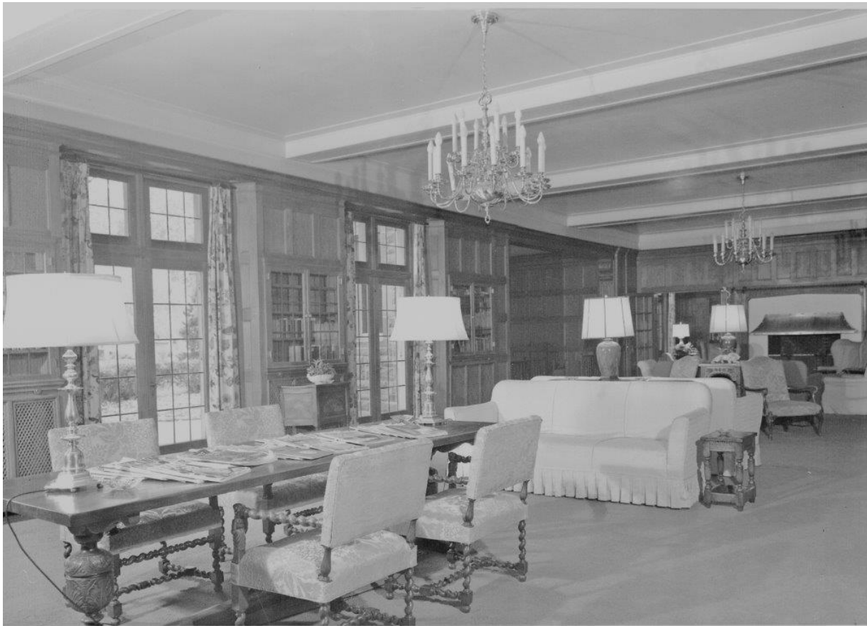
LEFT: Prior to becoming the Oak Room, which accommodated fine dining, the front section of the inn was a lobby.