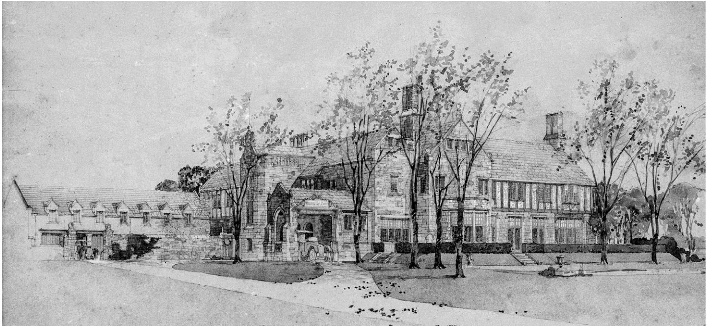
Architect Frank Packard's watercolor of the proposed new Granville Inn.