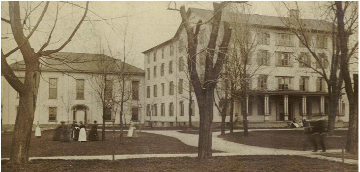
The Granville Female College occupied the property on which The Granville Inn was eventually built.

be demolished in 1997) on Granger Street between East Broadway and College. At the same time, Denison was beginning construction on the first two dormitories on the East quad (Sawyer and Beaver), having just completed the men's basketball gym on West College (known as the Wigwam) and the iconic Swasey chapel.