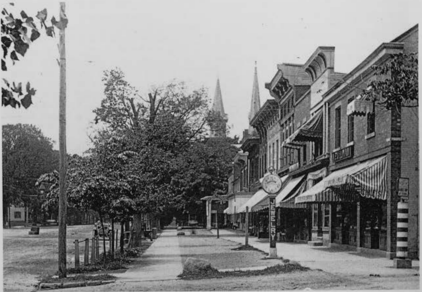
We know this photo dates from 1906 or after, because we see both the Buxton jewelry shop, with its non-functioning clock in front, and the Ullman drug store, which arrived in 1906. The clock was purely an advertisement, and had no works. Readers with good eyes will be able to make out the sign atop the barber pole, saying "Barber Shop Up Stairs." The awning in front of the Ullman drug store offers "Drugs and Books."