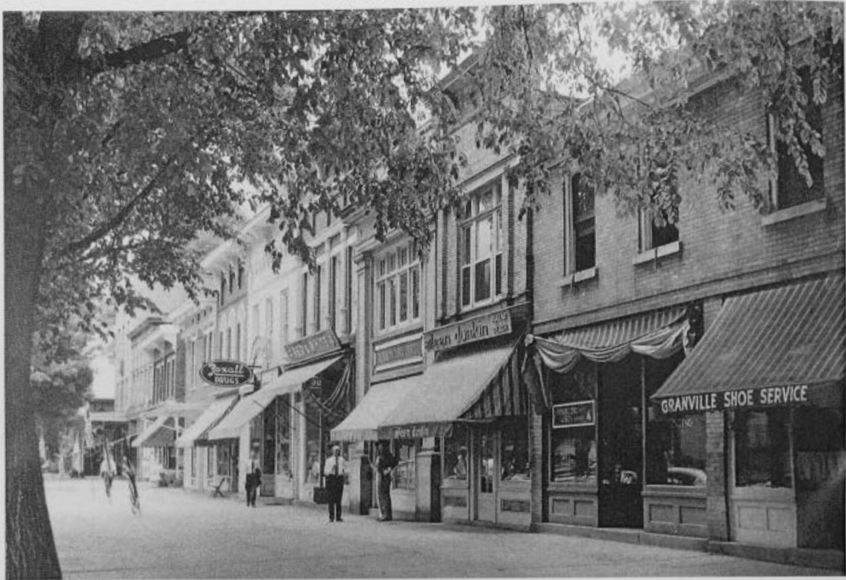
This photo from the mid-1950s shows the shoe repair shop in the east corner of the Granville Times building (142 East Broadway), and the Granville Times office itself next door, at 140 East Broadway.