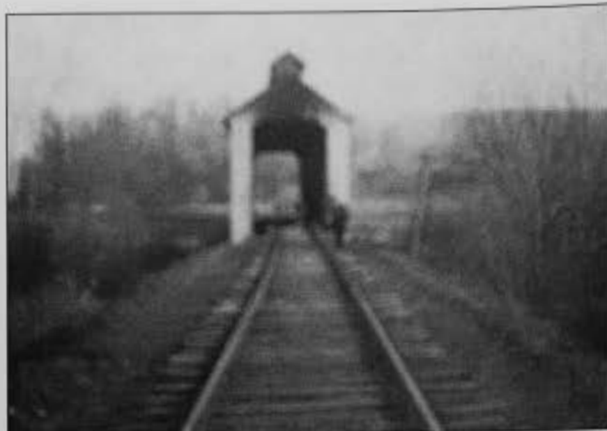
The T&OC bridge at the foot of Clouse Lane, where a bike path bridge is now situated.

Granville's last passenger train was a single passenger coach coupled to a slow freight train, and community memory holds that even that service ended in the 1950s. The village train station continued to function as a freight and Railway Express station (particularly handy for shipping trunks to Denison and home at the end of term), and the feed mill and Granville Lumber used railway cars for deliveries. To the delight of children of all ages, cabooses would continue to appear at the end of every freight train, regard-