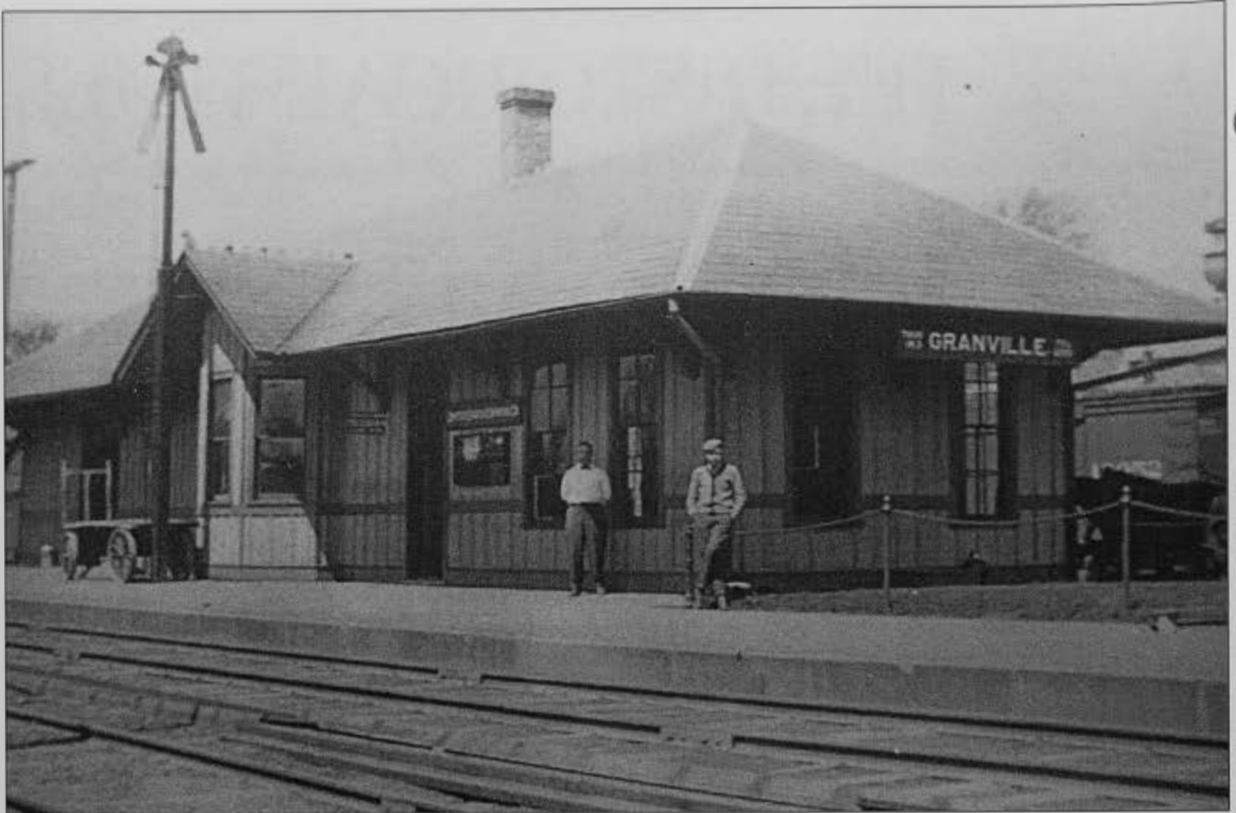
The Granville T&OC station, on South Main Street, in busy days. Note the boxcar on other side of station. (Undated photo.)