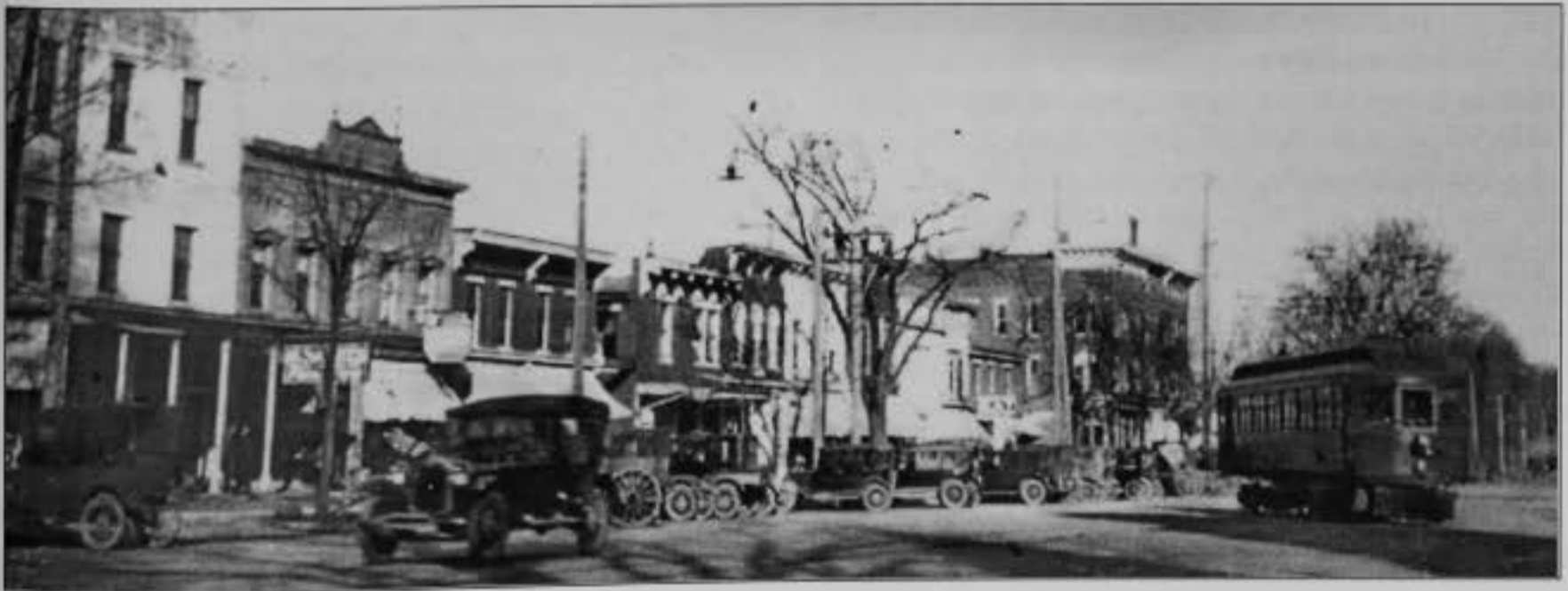
In its last decade before its 1925 closing, the Interurban turns from East Broadway into the station, which is today's Granville Historical Society Museum.