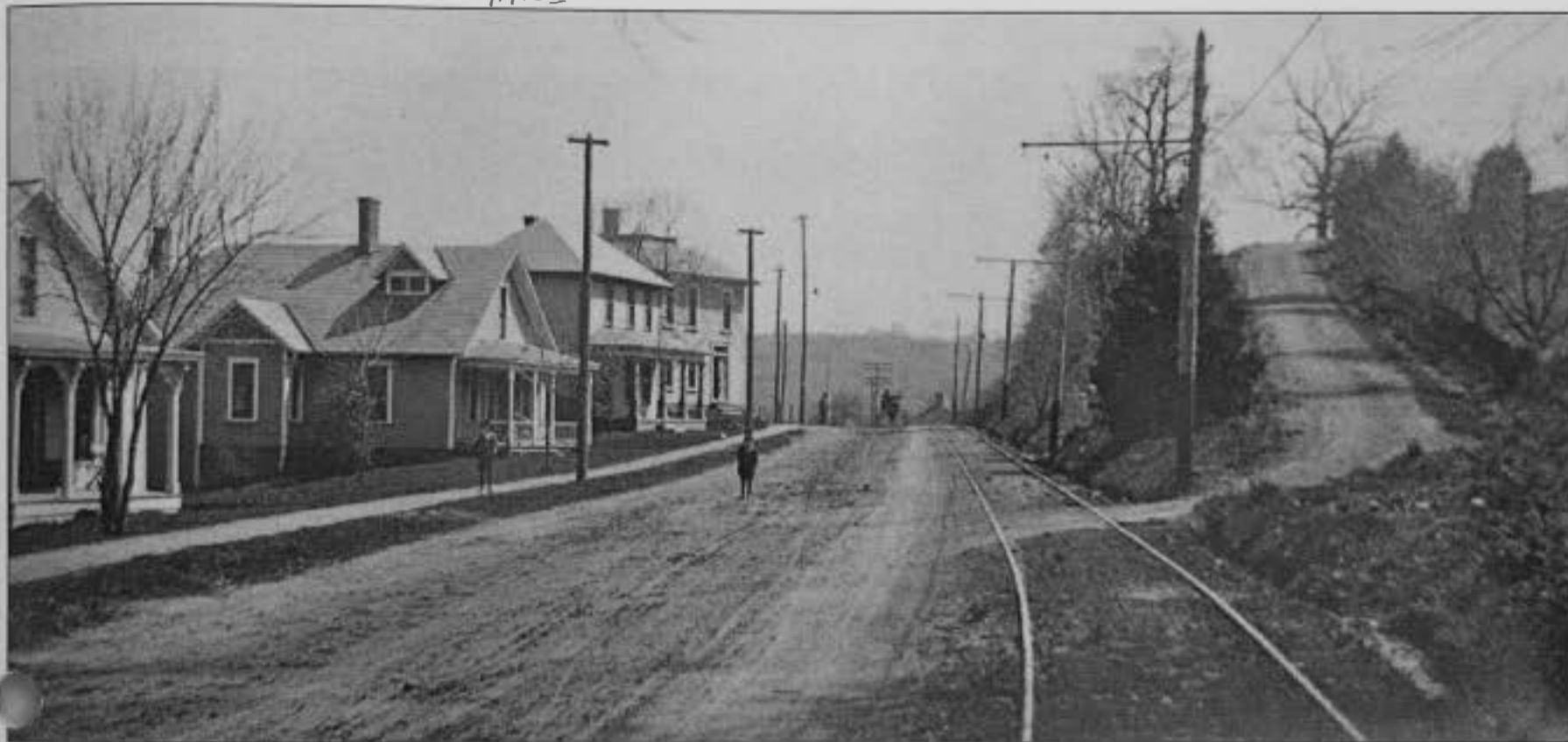
Interurban tracks looking east along Broadway at the base of Mount Parnassus.