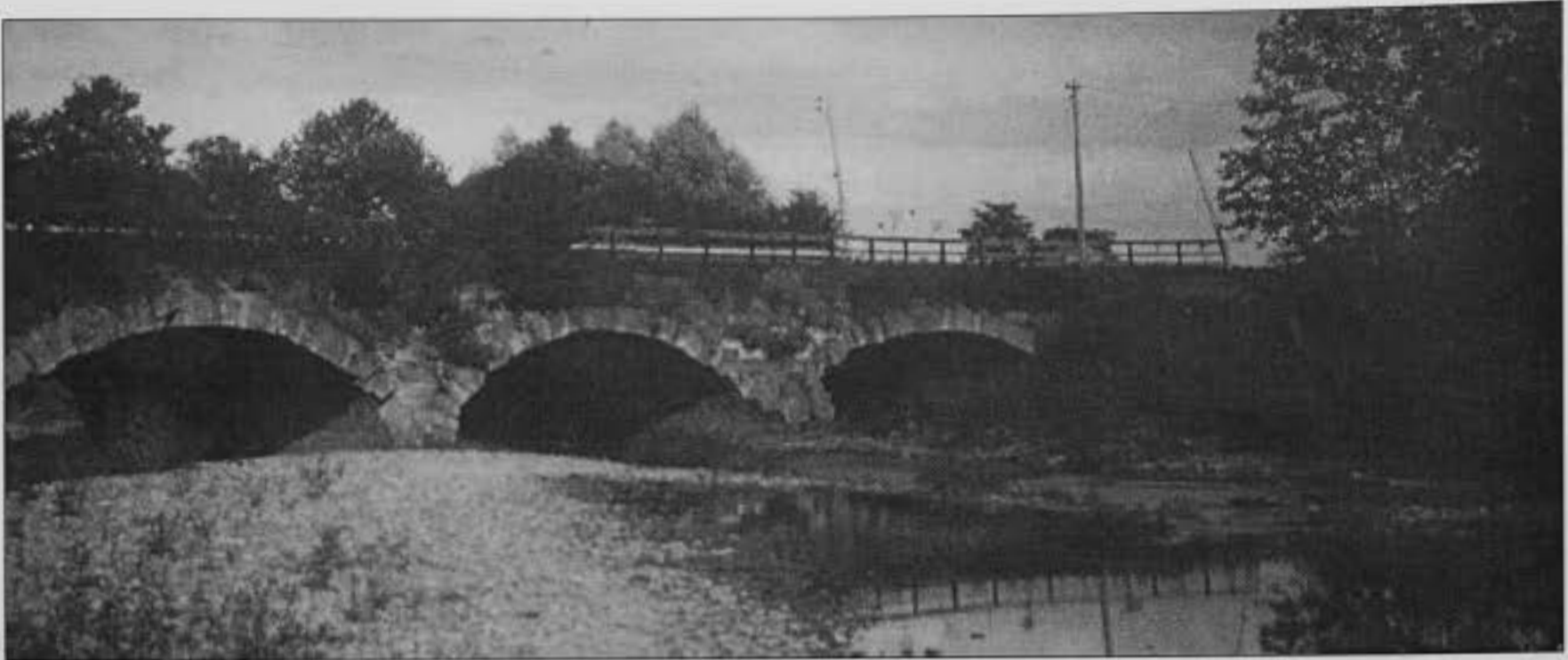
The 1835 aqueduct that replaced the original wooden structure that bore feeder canal boats--and the canal itself--over Racoon Creek on what is now Cherry Valley Road near the Reddington Road intersection. The bridge later served as the interurban bridge before supporting today's vehicular traffic.

stations such as Newark, Mt. Vernon or Delaware and seldom have more than ten miles to cover by road to get to their campuses.