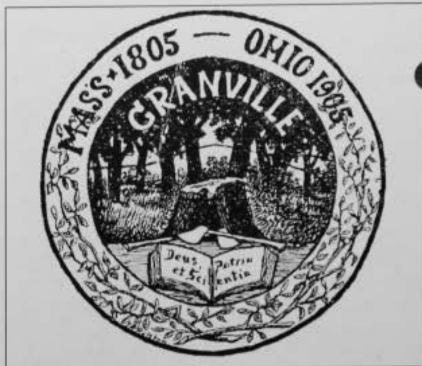
A logo for the 1905 Centennial celebration.

Historical Society, dating from 1844, existed, but it eventually merged with and became known as the Historical and Philosophical Society of Ohio." (from, www.ohiohistorycentral.org/entry.php?rec=2110&nm=Cincinnati-Historical-Society ). The community of Worthington, founded in 1803 and a model for the founding of Granville two years later, did not have historical society until 1955. The Western Reserve Historical Society, however, was founded in 1867.