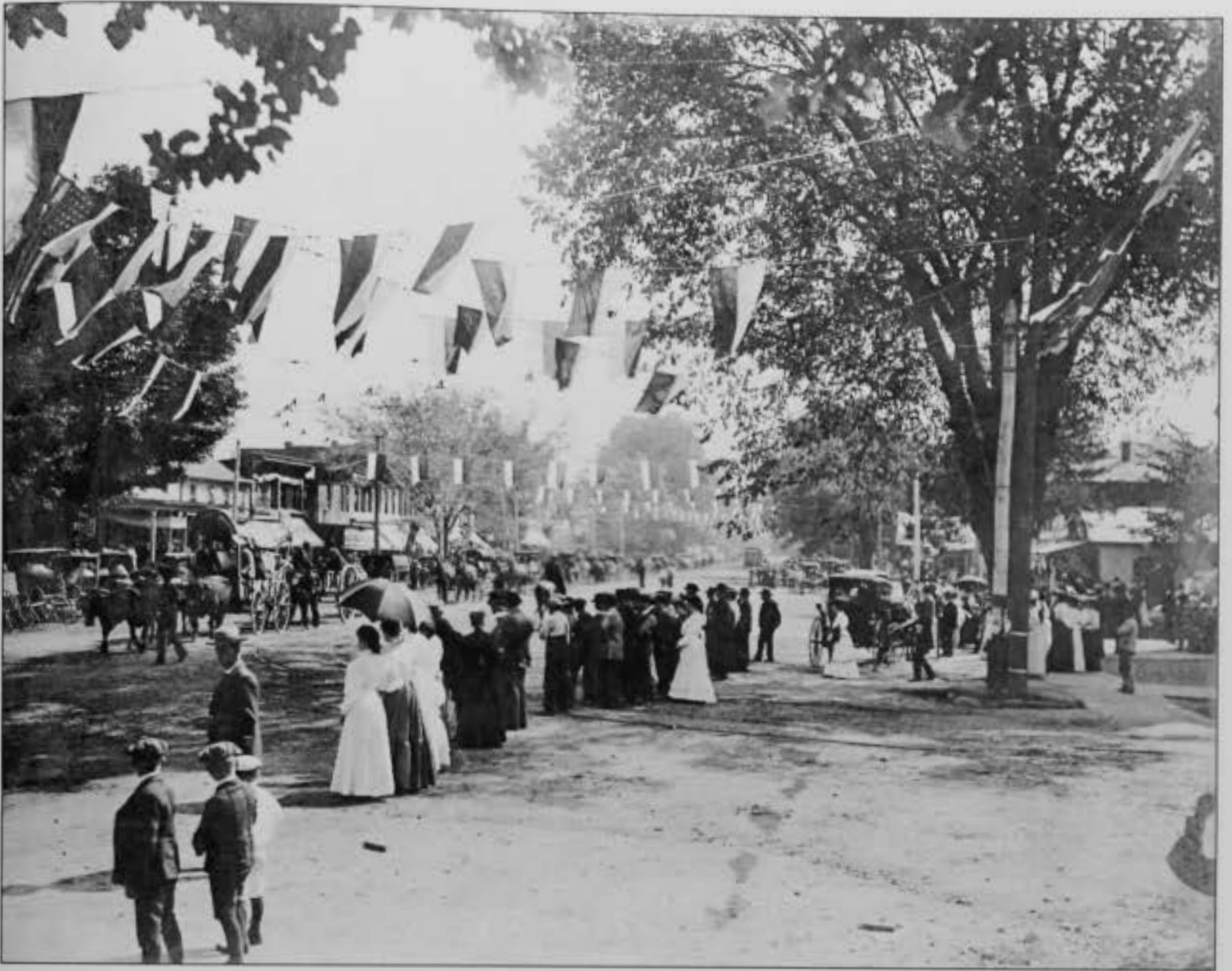
1905 GRANVILLE CENTENNIAL PARADE — The Centennial parade approaches Main Street on Broadway. Centennial fervor gave a boost to Historical Society membership.