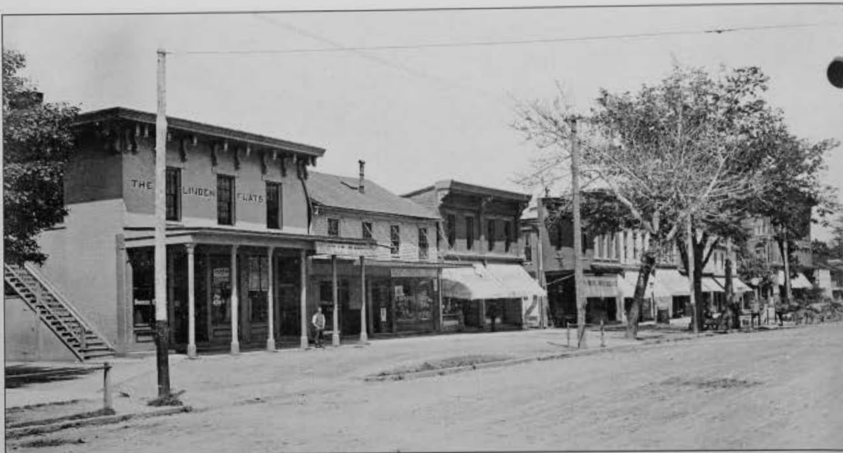
This is the north side of East Broadway, looking eastward from the intersection of Broadway and Main Street, during the 1890s.

is for his substantial contributions to preserving the history of Granville that the Historical Society celebrates him today.