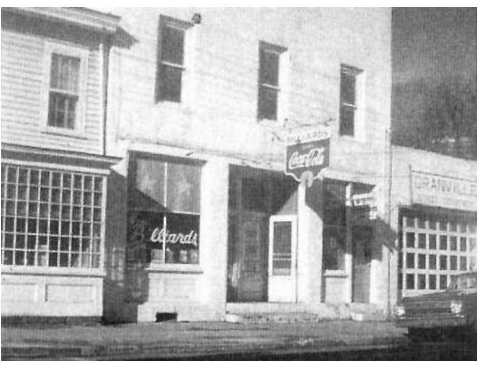
The pool hall was a staple of North Prospect, giving way to the Everest Gear store today.

Up the east side of North Prospect, beside Gregory Hardware, the next business was Don