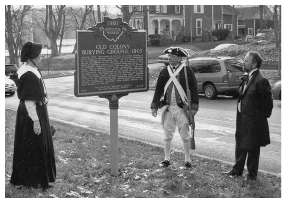
An Ohio Historical Marker was dedicated for the Old Colony Burying Ground in 2006.

"In 2001-2002 we undertook an oral history