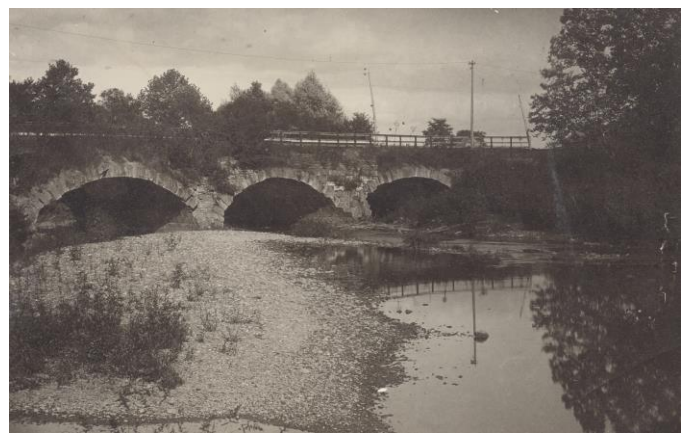
Showman's Arch, above, on Cherry Valley Road was an aqueduct that took canal boats over Raccoon Creek to the Ohio and Erie Canal.