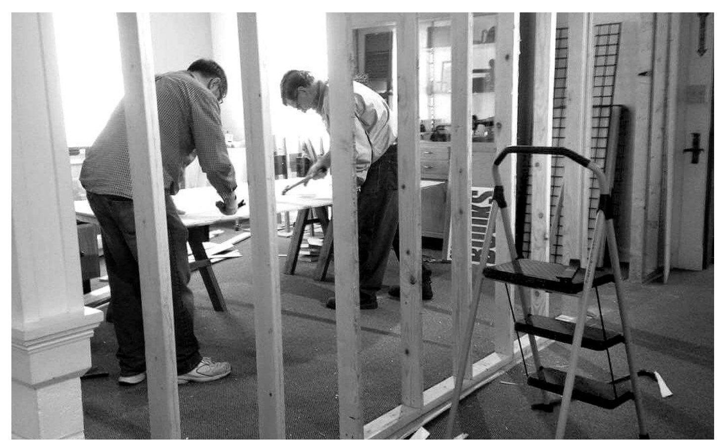
A temporary wall on the museum's first floor came down in January 2017 to create a brighter, more flexible exhibits space. The space inside the studs above was once the Society's tiny archives.