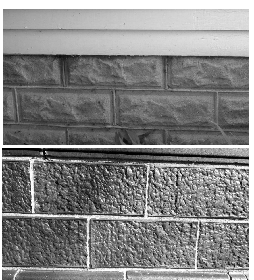
Foundations on homes around Granville often have a fake stone block on the outside (top) and glazed block on the inside (directly above).