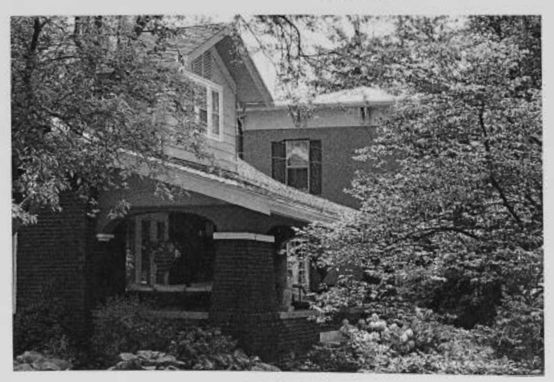
The 100 block of West Broadway.