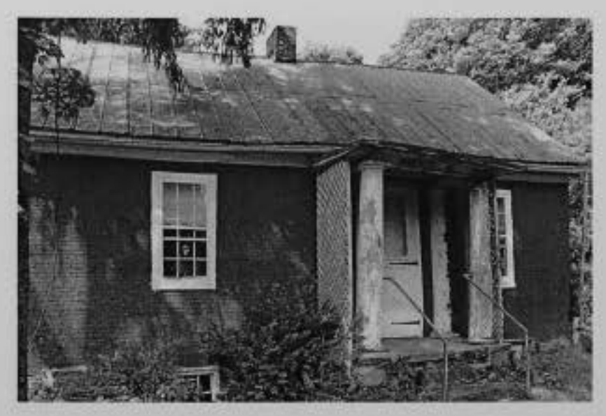
Tannery Hill, Granville's first brick house, was built in a very simple style by Spencer Wright between 1805 and 1810 as he traveled between Granville, Massachusetts and Ohio.

In early Granville, many of the vernacular structures were much the same and not far removed from the simple shape of the log homes that frequently preceded them: rectangular in dimension, moderately-pitched roof with the gables at the end, one and a half or two stories high (often with end windows in the eaves), and three to five "bays" wide (that is, a central door flanked by one window or two on each side, although the door could be offset to one side rather than positioned centrally). A fireplace and chimney could be at one end or two, or sometimes located in the middle of the house to heat all rooms. In a way, this is what we sometimes commonly think of as "colonial," because it often has a Georgian symmetry to it, but its roots are much more humble-in necessity rather than art. Look around Granville. You'll see a number of these. There are side by side versions of two story brick vernacular houses from the 1820s on