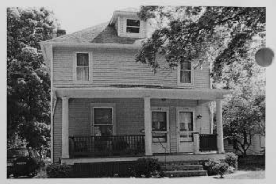
Four of many variants of the American Four Square in Granville. Above, left—East Broadway; above, right—East College; below, left—East Elm; and below right—South Pearl Street.