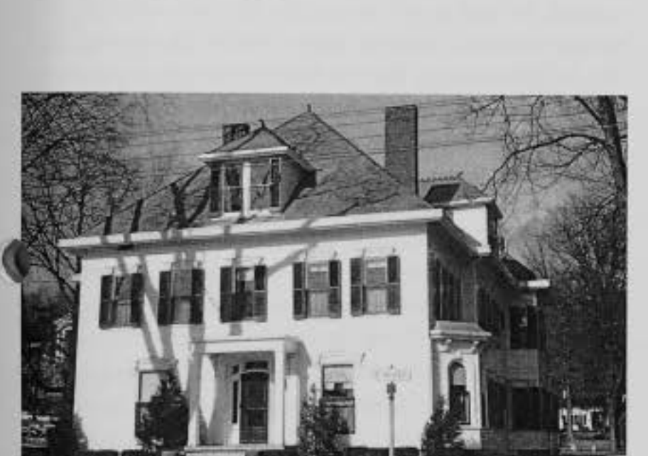
The large porch was removed and replaced in the early 1950s with a simple square portico when it became cooperative housing for freshman women at Denison.

that this was the twentieth century, Georgian Revival) style. Swasey Chapel and Beaver, Shaw, and Sawyer residence halls on today's East Quad were the initial manifestations of this. When the college got Monomoy Place and repurposed it as a women's residence hall, it also sought to Georgianize it. Off came the decorative brackets under the projecting eaves; later the wrap-around porch disappeared. A sort of Federal-style square-pillared front portico went on. White paint replaced what we now think from paint scrapings was originally a golden yellow (much as you see the house today) and, yes, dark green window shutters were added. Of course, it you stand in front of the house, you can tell it was never intended to be a symmetrical Georgian design; the second story windows