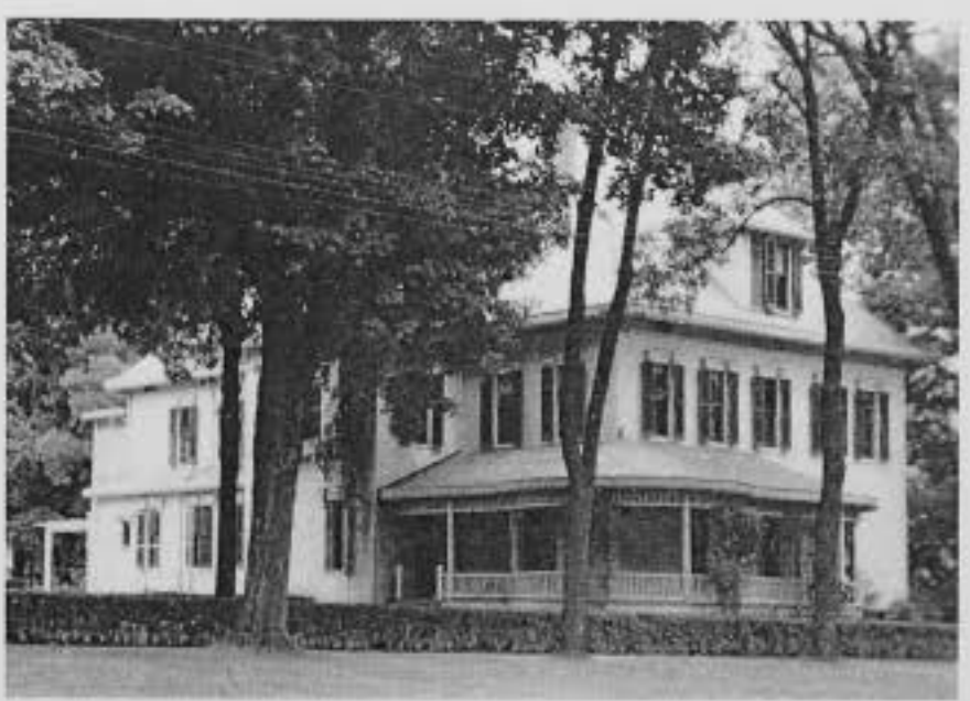
When Denison acquired it in 1935, Monomoy still sported its turn-of-the-century wrap-around porch, as it did through the 1940s. The third-floor ballroom, also turn-of-the-century, dramatically changed the earlier proportions of the house.

that this was the twentieth century, Georgian Revival) style. Swasey Chapel and Beaver, Shaw, and Sawyer residence halls on today's East Quad were the initial manifestations of this. When the college got Monomoy Place and repurposed it as a women's residence hall, it also sought to Georgianize it. Off came the decorative brackets under the projecting eaves; later the wrap-around porch disappeared. A sort of Federal-style square-pillared front portico went on. White paint replaced what we now think from paint scrapings was originally a golden yellow (much as you see the house today) and, yes, dark green window shutters were added. Of course, it you stand in front of the house, you can tell it was never intended to be a symmetrical Georgian design; the second story windows