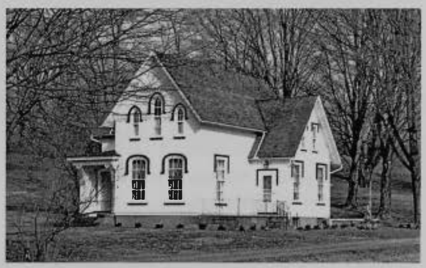
The Fidelia Rose house, another familiar Gothic Revival landmark, is located on Newark-Granville Road next to the entrance to Bryn Du Woods.

Granville—about the same time was the Tudor Revival, with its faux half-timbered façade and, often, use of stucco. Like Colonial Revival, the attraction to this was matching what was perceived to be a real "style" with modern convenience and construction methods. You'll see all of these in Granville.