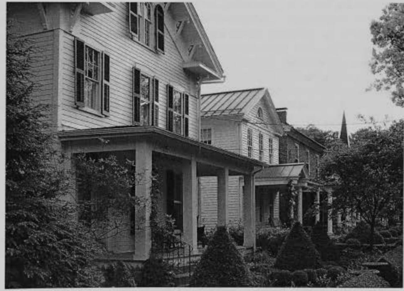
Each block in Granville reflects not only the community's past but also its ongoing architectural and social history.

graduated from high school in a town located in northeastern Ohio's Western Reserve that was especially proud that it was founded at the end of the 18th century, half a dozen vears before the first settlement Granville. Following the Second World War, many residents convinced themselves that theirs was the quintessential "New England" town, and they went about identifying what they took to be an "colonial" authentic residential architectural style and imposed it on one another through both statute and social influence. Throughout the 1950s, '60s, and '70s new homes sprang up and