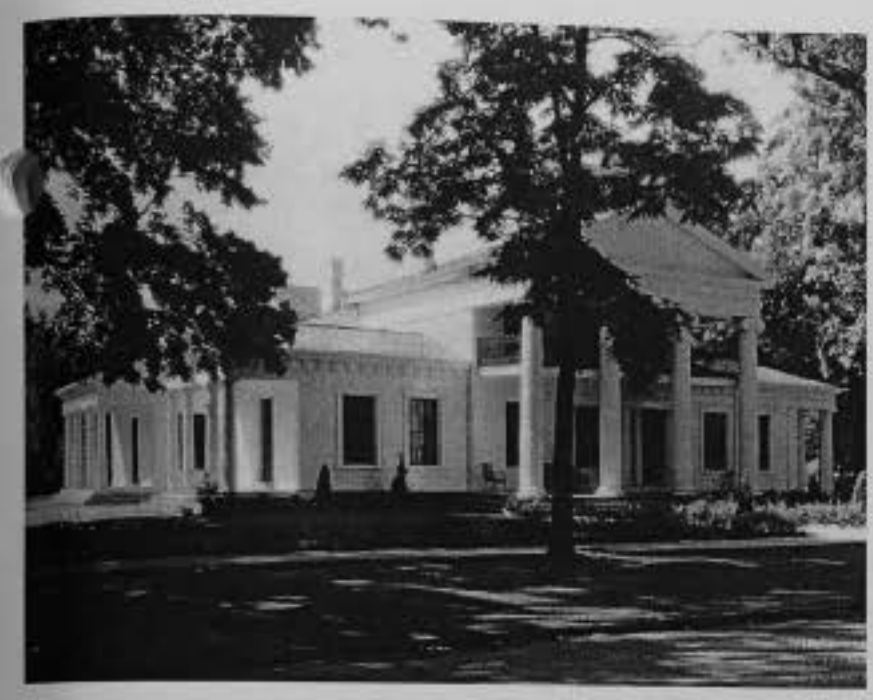
The 1842 Avery Downer House is a textbook example of high-style Greek Revival architecture.

The patriotic ardor that inspired at some Granville men to join the American army of the Northwest showed up in architecture, too. The Greek Revival style was not only a rejection of English fashion but connected the aspirations of the young American nation to the classical republics of the Old World. In Granville, the most prominent example of Greek Revival is the Avery Downer house (photo above), built in 1842, toward the end of the enthusiasm for the style in America. With the gable of its central lowpitched roof to the street and fronted by a columned portico and with matching single story, hipped roof wings to the side, it was meant to give the appearance of a Grecian temple. The broad frieze below the eaves is ornamented on the side wings with classical patterns. But Greek Revival could take more modest form, too. Three doors west of the Presbyterian church is another home of the 1840s that reputedly served mid-century Granville as a baker's shop and residence (photos, page 8). Its gables are on the ends of the house like some of the older vernacular structures, but the Greek Revival detailing is unmistakable: square white columns on the corners of the grey-painted house, a wide frieze at the top, and geometric detailing in the upper corners.