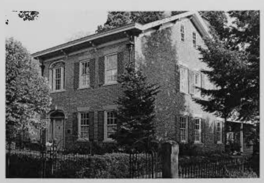
The fine fanlights over the front door and upper window are distinctive features of the Lucius Mower House on East Broadway.

more than a century of architectural, social and, in this case, institutional history.