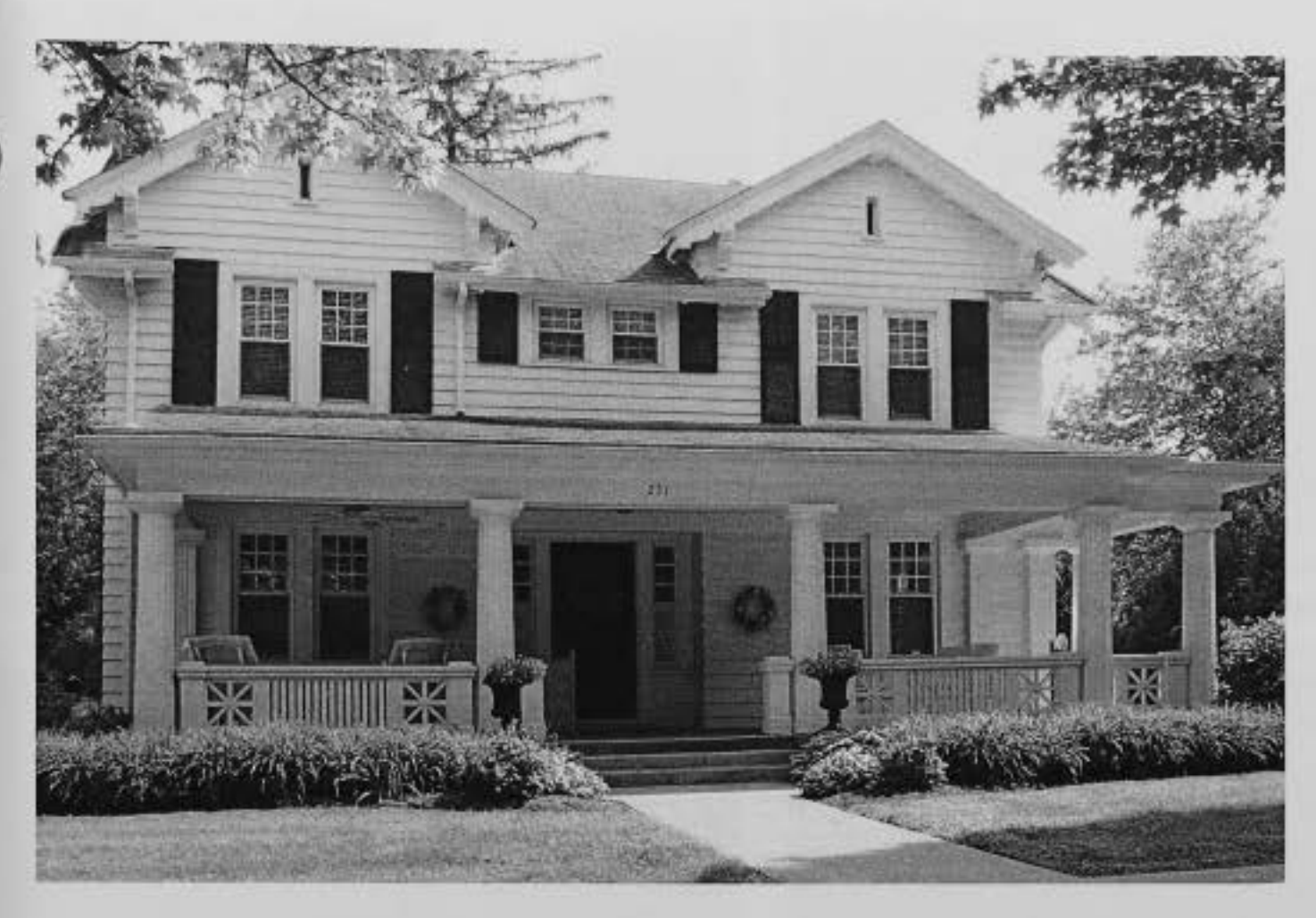
The 1916 Deeds House on West Broadway.