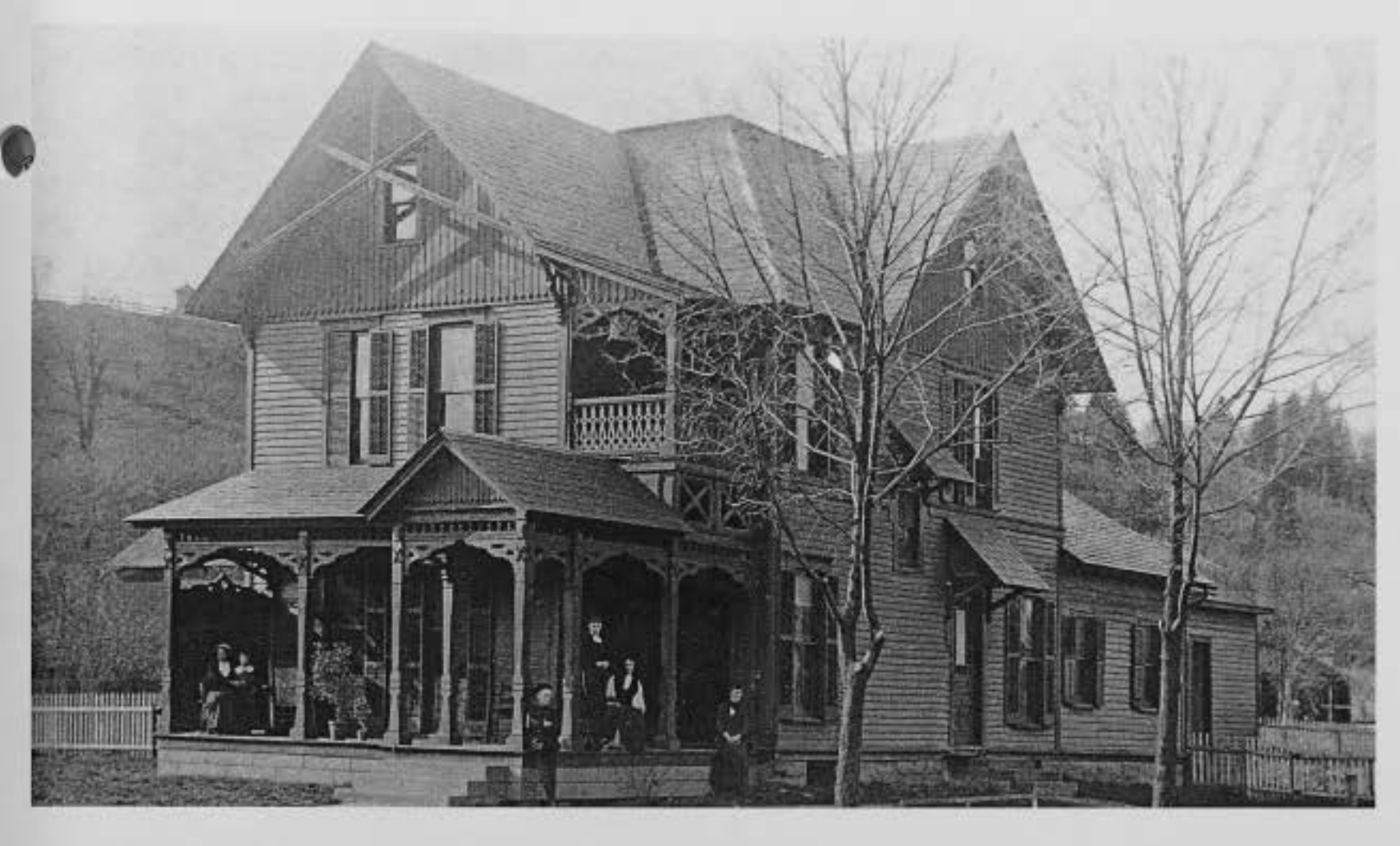
Pen Coed, still thriving at the corner of College and North Pearl streets, is a rare example of the Stick style in Granville.