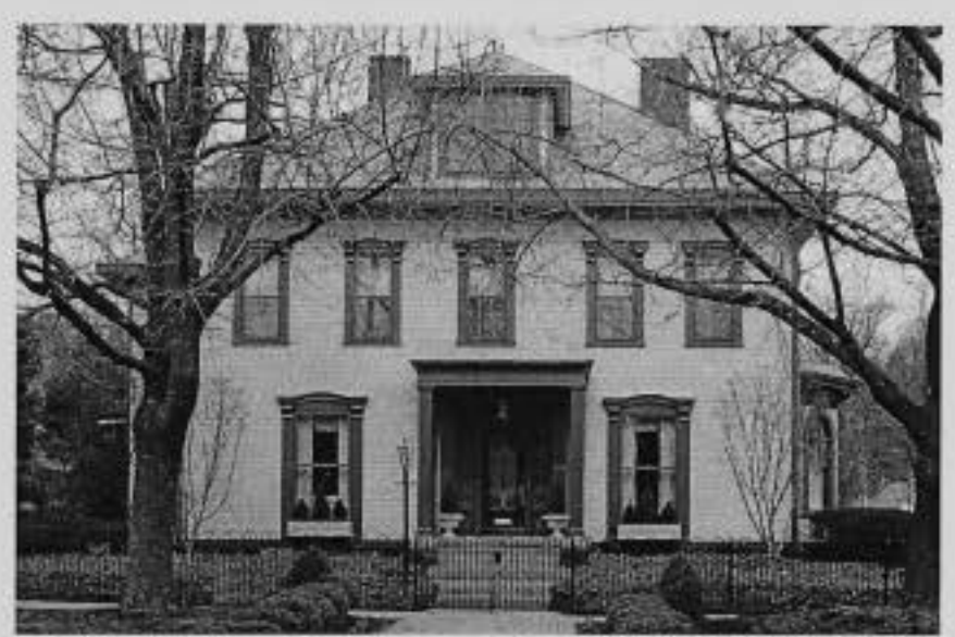
Serving as the home of Denison's presidents since 1979, Monomoy is an aggregation of styles reflecting its many incarnations.

don't line up right in a symmetrical pattern. By the time the home was restored as the president's residence forty-five years later, Denison architecture had become more eclectic and while the "grey mist" paint job of the 1980s and '90s wasn't too different from the 1930s white, the remnants of Italianate detailing were given a little more emphasis with a rust coloring. When Monomoy Place was due for a total repainting in the last decade, the college researched both the house and the original style and gave it a color scheme that would be more authentic as well as highlight the Italianate features. Still, it would be a stretch to say that the house has been restored to its original iteration as a Tuscan-style villa. Rather, today's Monomoy Place, like so many Granville homes, captures