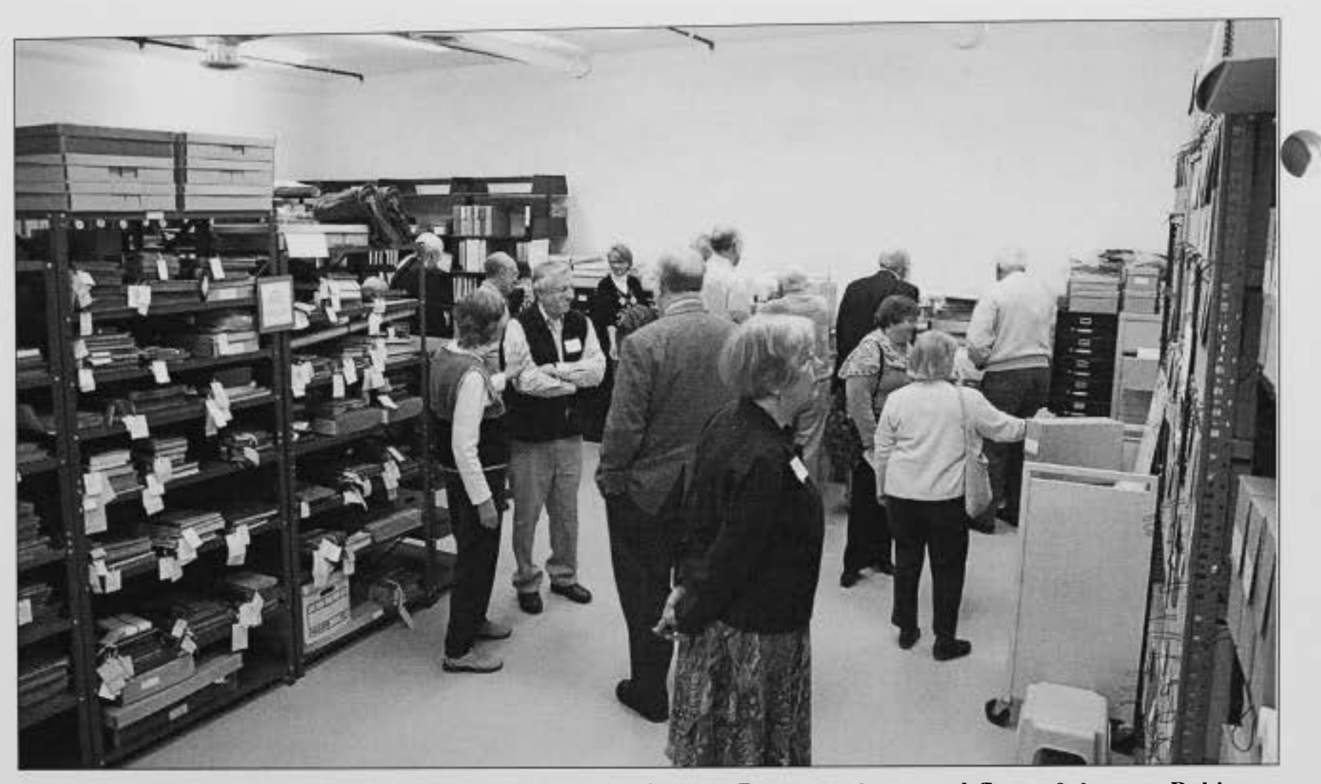
Guests and visitors browse through the new Archival Storage Room on the second floor of the new Robinson Research Center.

was thought a worthy competitor to Columbus (really an invented place across the Scioto River from Franklinton) for selection as the new state capital in 1803. And the early residents of Granville invested in industry and commerce as if they intended to compete. Within a quarter of a century of the founding there were grist mills and fulling mills, distilleries and ropewalks, manufacturers of hats and guns, odorous tanneries and a foundry which not only produced pots and pans but sent steel to Columbus where a new plow manufacturer was making a name. To promote commerce a bank was required, and when the Ohio Canal passed as close as Newark, a branch was constructed to Granville, not only to draw upon the Raccoon River to keep the main canal line's water level high but to promote trade. The founding of the Baptists' college for the training of clerical, civil, and commercial leaders in Granville in year 26 of the town is evidence that it wasn't just the locals who thought the town was a "happenin" place. Of course, the Congregationalists in Ohio thought the happenin' place was Hudson, where they had earlier founded Western Reserve College; the Presbyterians thought it was New Concord (and when that turned out to be not so happenin', they thought maybe Wooster was). And, in time, the Methodists and the Lutherans thought that Delaware and Springfield were destined to be the new centers of commerce and gov-