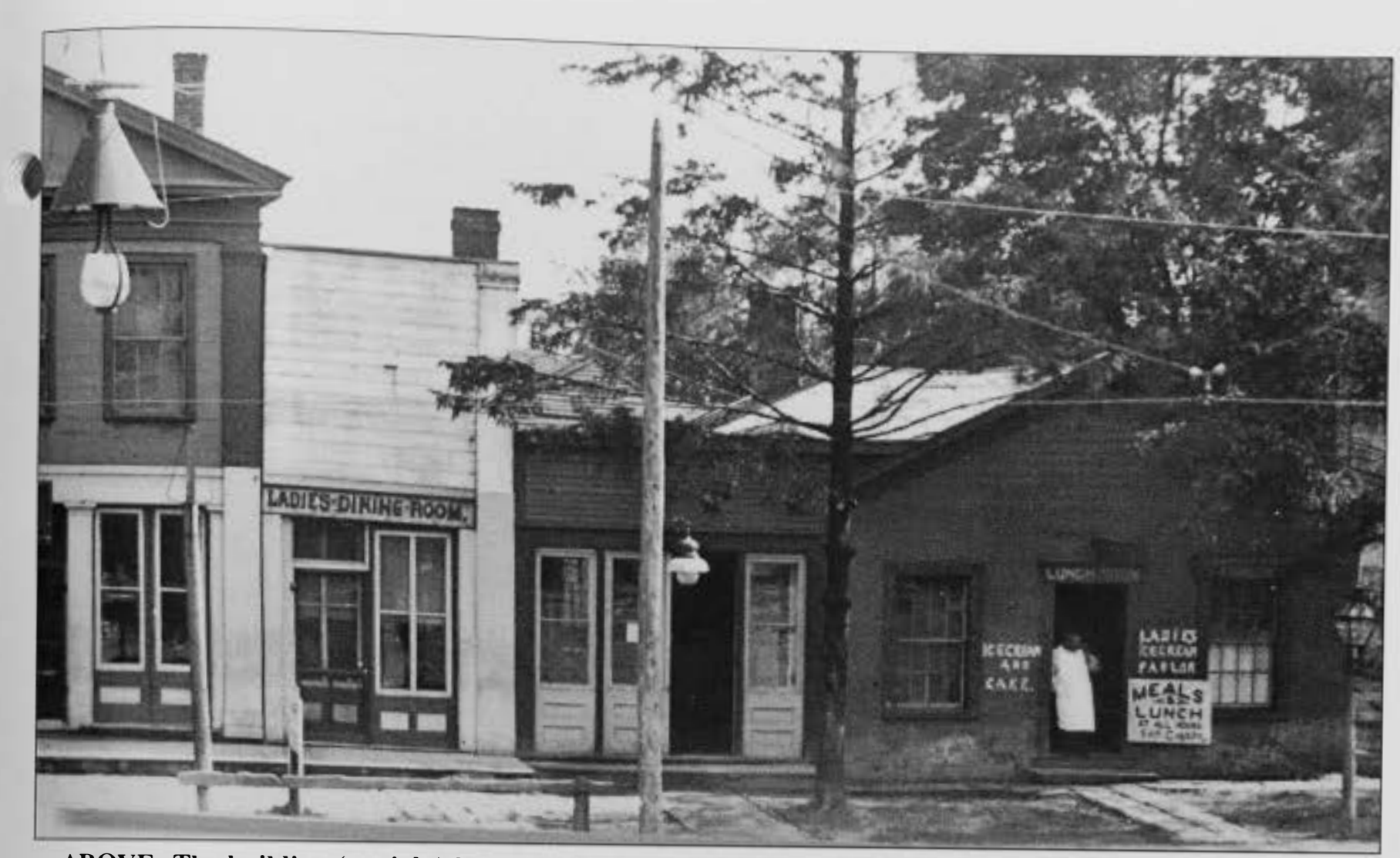
ABOVE: The building (at right) between 1891 and 1916 when it was an ice cream parlor. The buildings to the left burned in 1927. BELOW: The building sometime after 1916 when it served as the Interurban station.