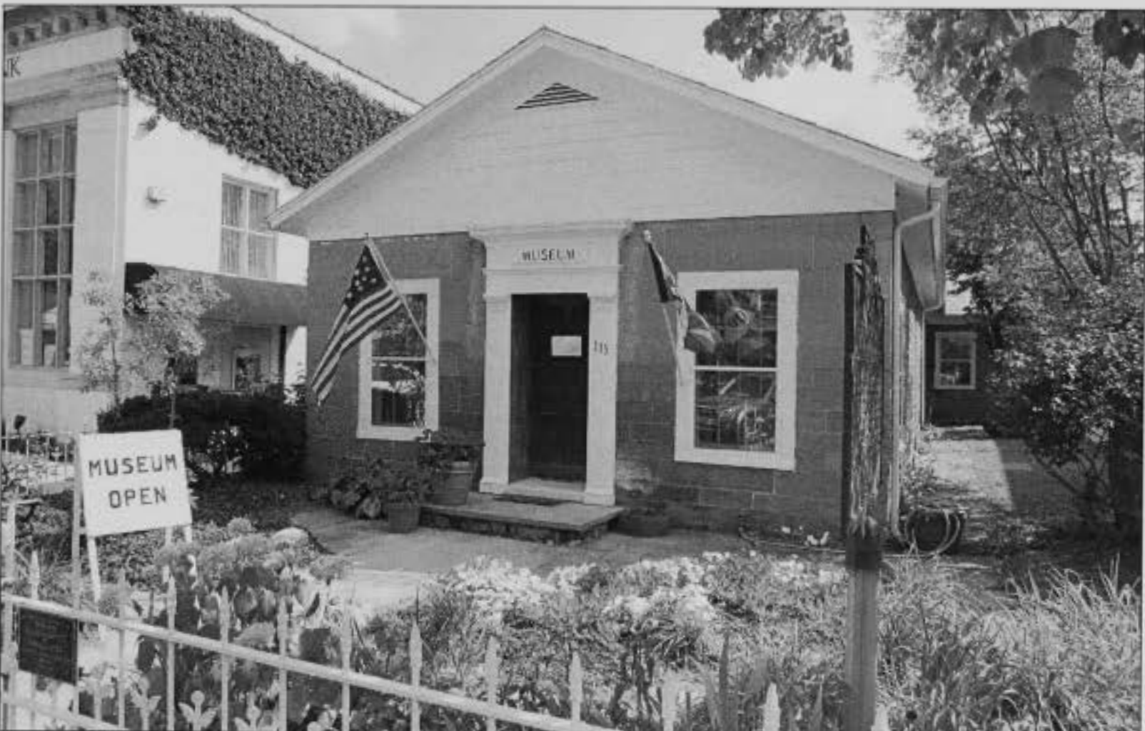
BELOW: The front of the Granville Historical Society Museum in August 2012.