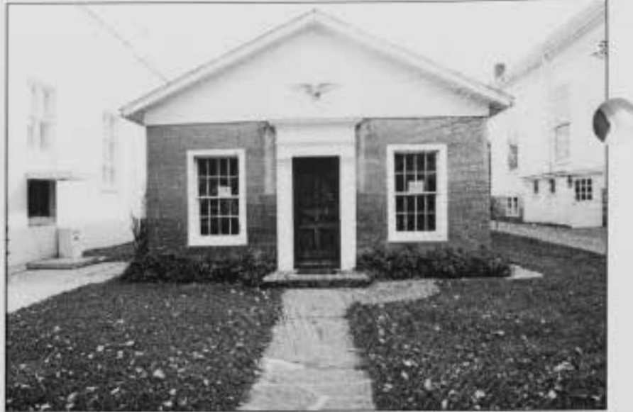
ABOVE AND RIGHT: Both are views of the Granville Historical Society Museum in 1975.