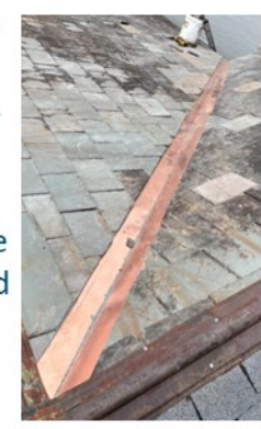
Museum Flashing Repair

On the outside, the Old Academy Building and our original building have both had much needed gutter, downspout, flashing and tile work.