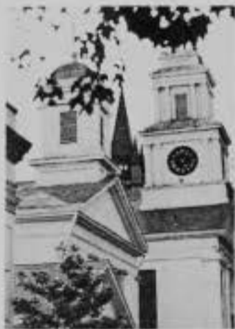
УЛУАГ СВИНКОТТА

В один прекрасный день, 1817 года американский иммигрант из штата Нью-Йорк, принадлежавший по имени Теофилюс Рид, обнаружил в поисках своего стада в долине, неподалеку от местечка Охайо, идеальную усадьбу. Попробовав, он решил, что единичный мир неизбежен, — но следом еще несколько семей увидели новые поселения Гранвилла, постепенно превратившись в место, которое представляло собой их дом.