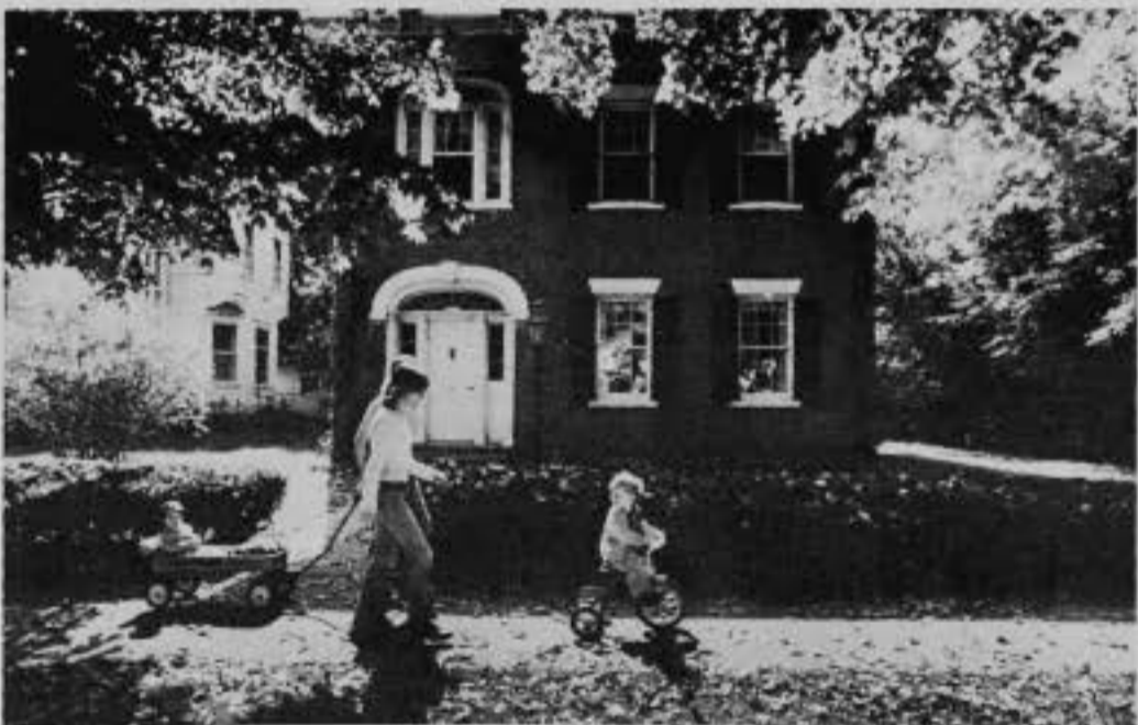
Гранвилл гораздо ближе похож на деревню Новой Англии XIX века, чем на современный город в Охайо.

Жители Гранвилла до сих пор любят рассказывать историю о Теофилюсе Риде и живут до сих пор так же спокойно, как те первые поселенцы. Прочность семейственности придает село особый колорит, выросших в большом городе или в пригороде, где население так быстро и так быстро меняется, что не успевают и обмыслить и речи. В Гранвилле же остается много традиций. Домашние хозяйки ходят в магазин, чтобы купить продукты, и покупают их в магазине. Покупки они делают у себя дома. Покупки они делают у себя дома. Покупки они делают у себя дома. Покупки они делают у себя дома.