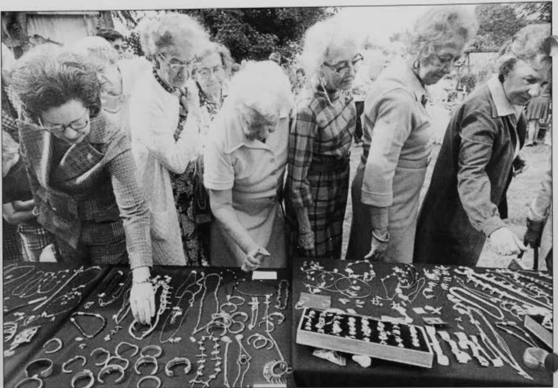
Citizens inspect glittering items at the annual summer street sale on Broadway.