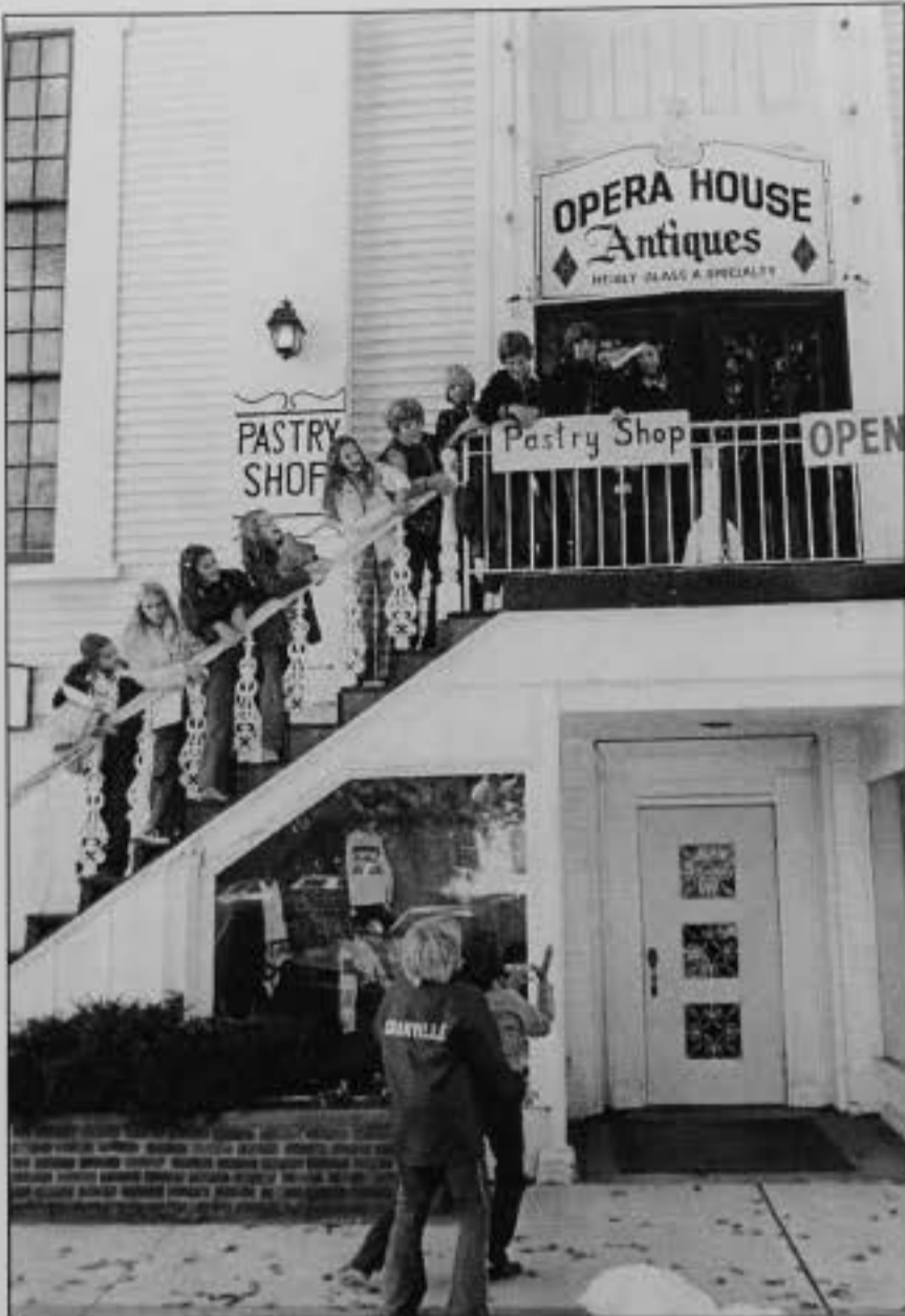
Children lured by the Opera House pastry shop after school. Originally the 1849 Baptist church, the structure was moved across Main Street in 1882 and served many community and commercial uses over the years. It burned down in 1982.

vert it into a center for older persons. "My dream was to have a house that would be warm and inviting, not a cold institution," she says.