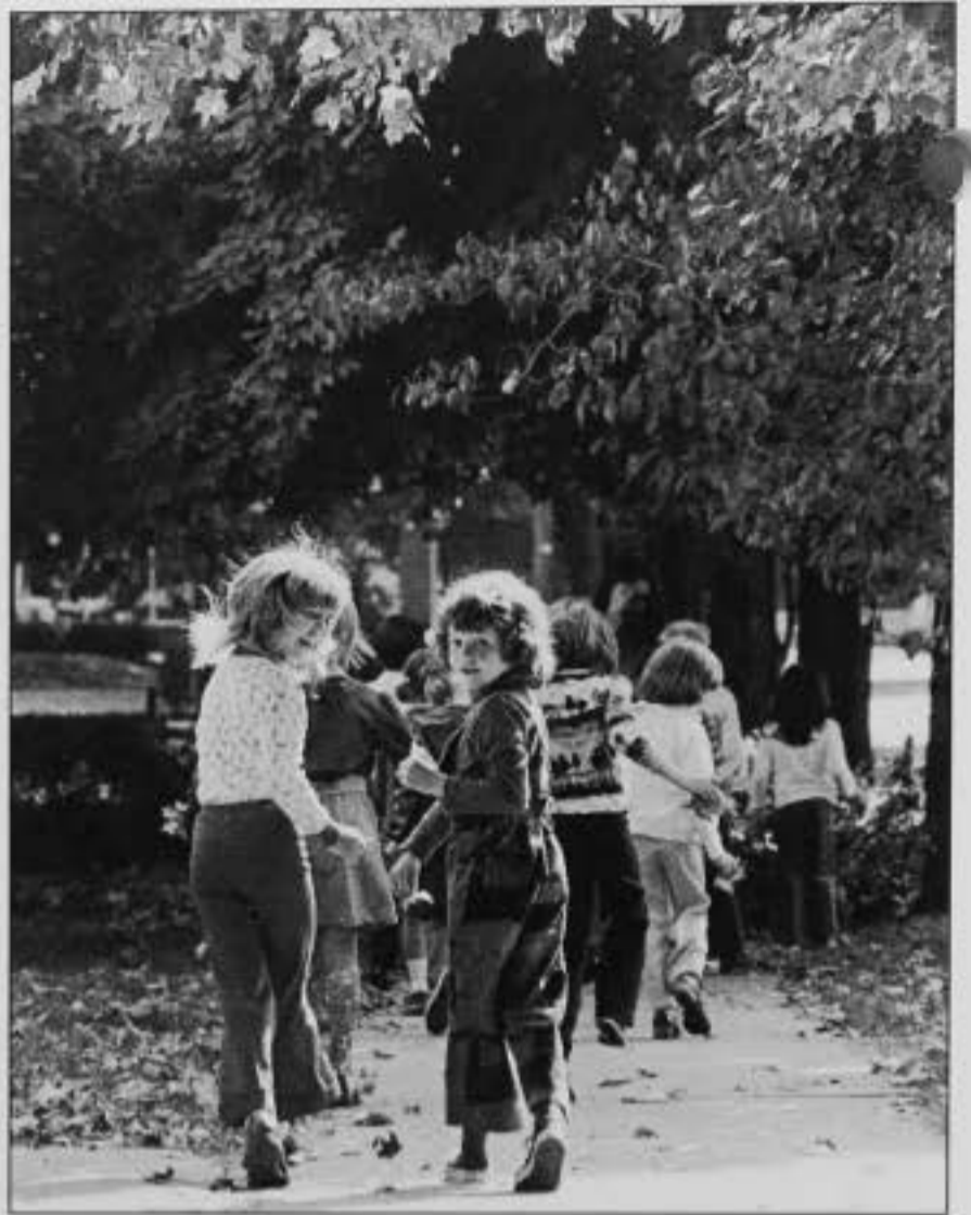
A class outing.